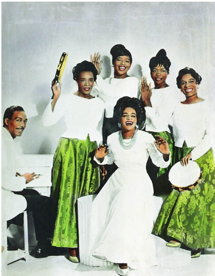
Image: Clara Ward and The Famous Ward Singers